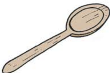
A WOODEN SPOON