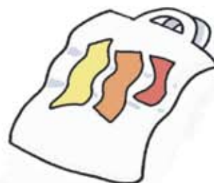
A PLASTIC BAG