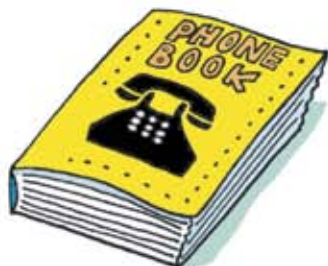
A TELEPHONE BOOK