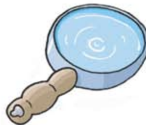
A MAGNIFYING GLASS