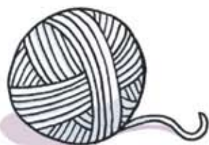
A BALL OF STRING