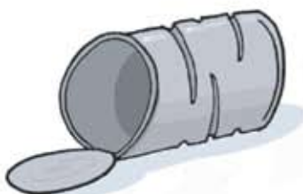
AN EMPTY TIN CAN