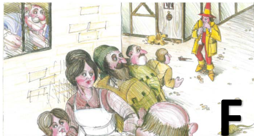
Pied Piper [paɪd] ['paɪpə]